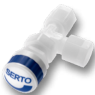
Elbow regulating valve SO NV 22A21E