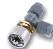
Elbow regulating valve PA SO NV 31A21E