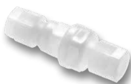
Taper seat non-return valve* SO CV 23A21