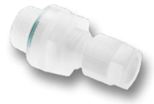
Panel mount male adaptor union with Conovor O-ring seal SO 21524