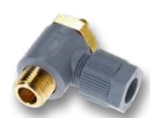
Single banjo PA with throttle valve SO 37621