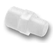
Male threaded adaptor SO 21109