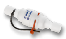
Safety coupling: coupling PVDF "Plus" COP KA/NS, COP TA/NS