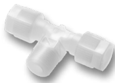
Male adaptor tee union* SO 23721