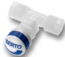
Regulating valve* SO NV 22A21