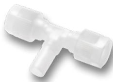
Adjustable tee union* SO 23621