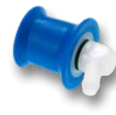
Safety coupling: coupler with hose nozzle angled CO KAU/BS-SOT