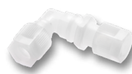
Panel mount elbow union* SO 22721