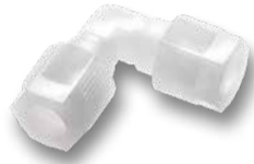
Elbow union* SO 22021