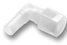
Adjustable elbow union* SO 22621