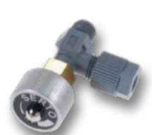
Elbow regulating valve PA with male adaptor thread SO NV 31A21EB