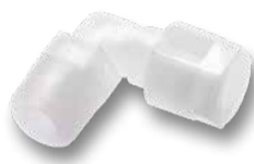
Male adaptor elbow union* SO 22421