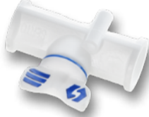
Stopcock* SO BV 28A00