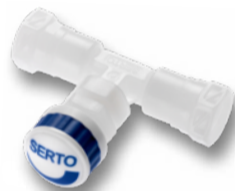
Regulating valve with female thread SO NV 22A00