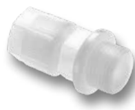
Male adaptor union with edge seal* SO 21124