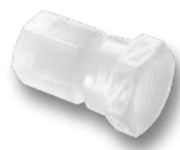
Female adaptor union* SO 21221