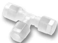
Tee union* SO 23021