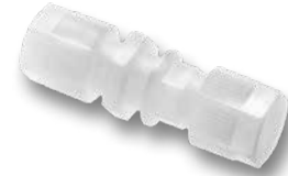
Panel mount union* SO 21521