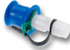
Safety coupling: coupler with SERTO connection CO K/BS-SOI