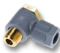
Single banjo PA SO 32821