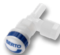
Elbow regulating valve adjustable SO NV 22A21EL