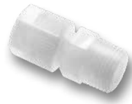
Male adaptor union* SO 21121