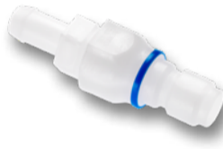
Safety coupling: nipple with hose nozzle CO T/B-SOT