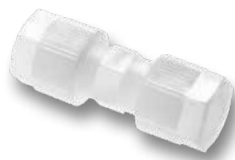
Straight union* SO 21021