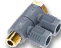
Double banjo PA SO 32921