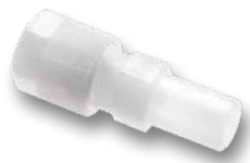
Adjustable reduction union* SO 21821